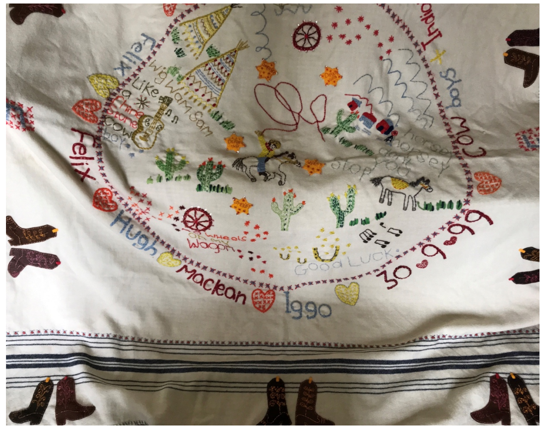
Figure 1: A Modern-Day Heirloom - Blanket for 'Felix', Shirley Mclauchlan, 2003. On loan courtesy of Sheela Maclean.