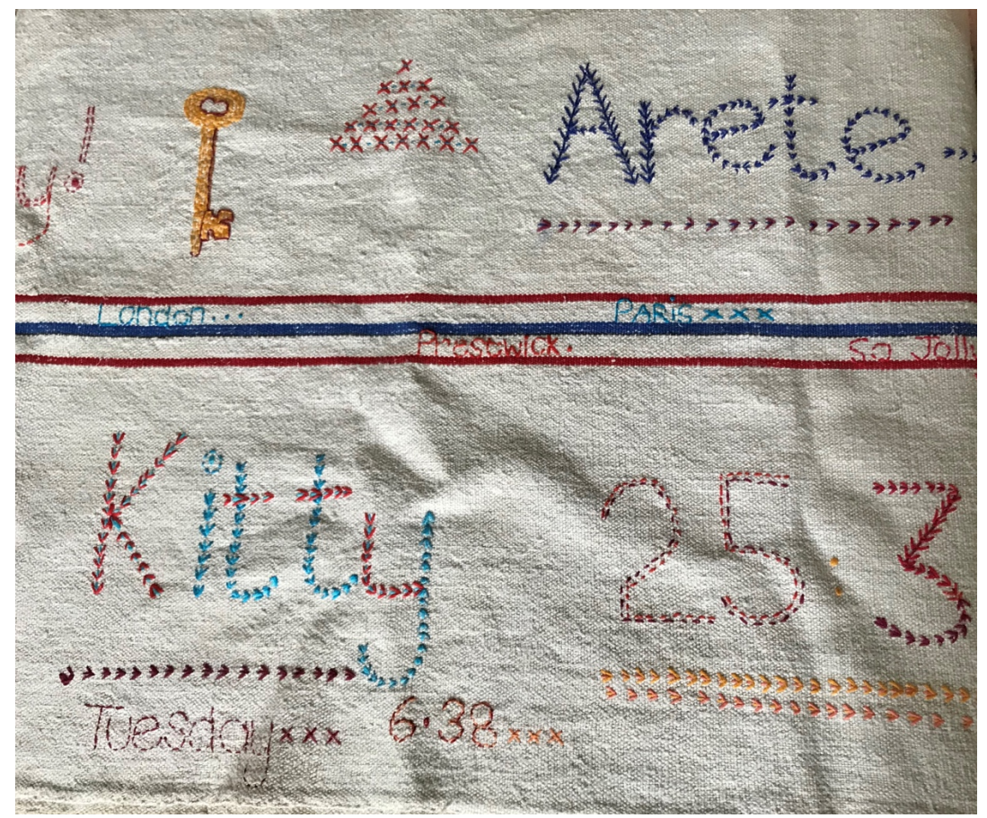
Figure 2: A Modern-Day Heirloom - Table runner for 'Kitty', Shirley Mclauchlan, 2018. On loan courtesy of Kitty Mclauchlan.